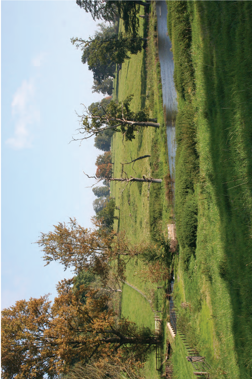
Fig. 1 Photograph of an area in which a geographical investigation is to be undertaken